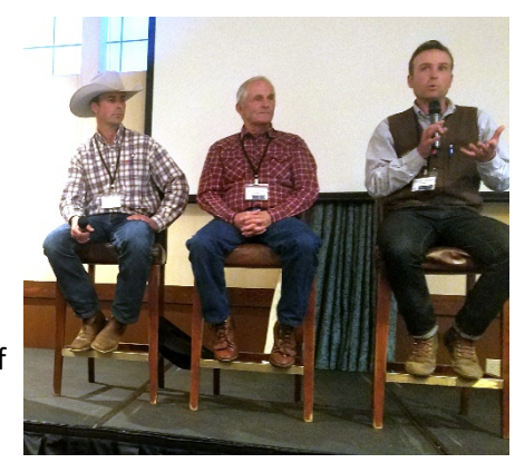
Panel members share their experiences, both good and bad, with students and other producers about their management changes.

Students came away from the day with an increased knowledge of the complex interactions of managing a cattle operation, as well as new ideas for how management changes can provide new opportunities to better fit the livestock to the land and their lifestyle.