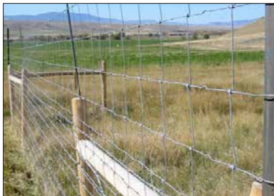
Mesh fence extension on top of existing livestock containment fence.

Protect young trees from browse and scrape damage by wrapping them with Vexar®, Tubex®, plastic tree wrap or woven-wire cylinders. Usually a four-foot-high woven-wire cylinder will keep deer from rubbing tree trunks with antlers.