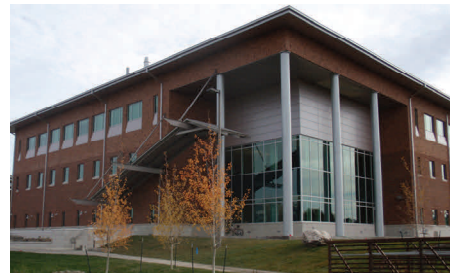
The new Animal Bioscience Building

With special thanks to the entire A&RS Administrative Team