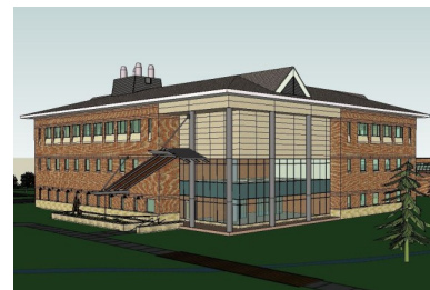
Drawing of the new Animal Bioscience Building