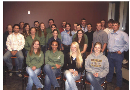
2011 Range Management Club