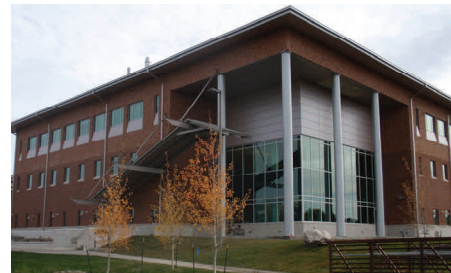
The new Animal Bioscience Building

With special thanks to the entire A&RS Administrative Team