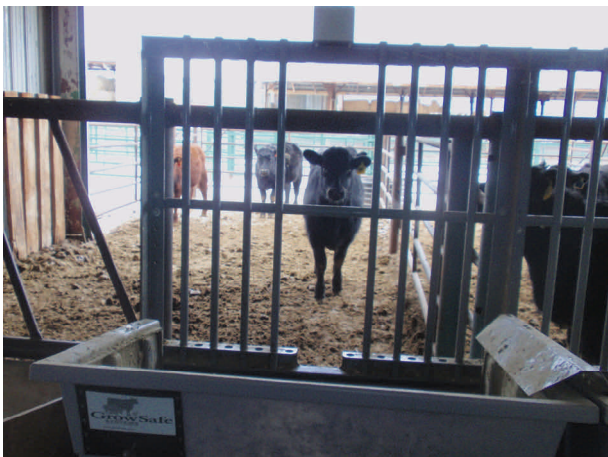
Heifers used in study using GrowSafe system.