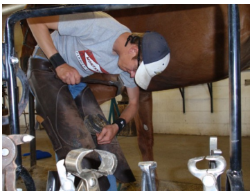
Student working inside during Spring 2009 session