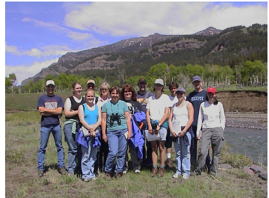
ARNR 480 class in Yellowstone Park