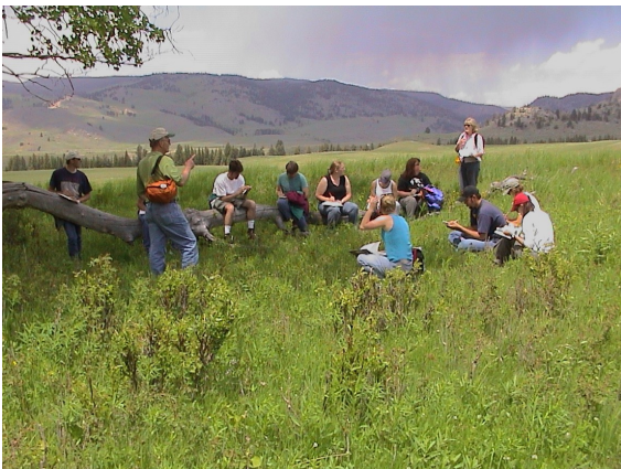
ARNR 480 class in Yellowstone Park

The course relies heavily on two one day field trips to enhance the learning opportunity. Field observations are made on all of the above topics. Students greatly appreciate the course and the experiences it offers.