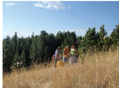
490 Ranch Class at a ranch in Roy, MT