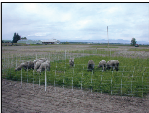
Before and after photographs of sheep used to terminate a cover crop used in an organic crop rotation system at Post Farm (off Huffine Road in Bozeman).

In conjunction with the Sustainable Food and Bioenergy Systems: Interdisciplinary B.S. Degree Program and the new sustainable livestock production option, Patrick Hatfield is developing and teaching a new class: ARNR 222 Livestock in Sustainable Production Systems. This course will consider all aspects of incorporating livestock (sheep, goats, beef and dairy cattle, poultry, and swine) into sustainable production systems. In addition to Hatfield, this class will draw on the expertise of Glenn Duff (beef and dairy), and Charles Holts (Poultry). The course is divided into a series of modules. The course goals are: a) Students develop a better understanding of the concept of sustainability as it applies to livestock and livestock integrated into other agricultural systems. b) Expand student appreciation for beneficial traditional and non-traditional partnerships that promote sustainability. c) Further develop critical thinking and evaluation skills.