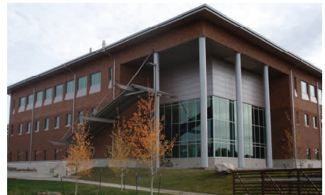
The new Animal Bioscience Building

With special thanks to the entire A&RS Administrative Team