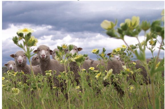
Sheep graze in a patch of sulfur cinquefoil in Lake County, MT. The project explored the potential for sheep grazing or mowing to reduce the seed production of this noxious, invasive plant.

Jim Story, retired MSU Research Scientist, rounded out the day with a crash-course in insect identification and a history of the spotted knapweed biological control program in Montana. Despite the high temperatures, people stayed for well over 4 hours