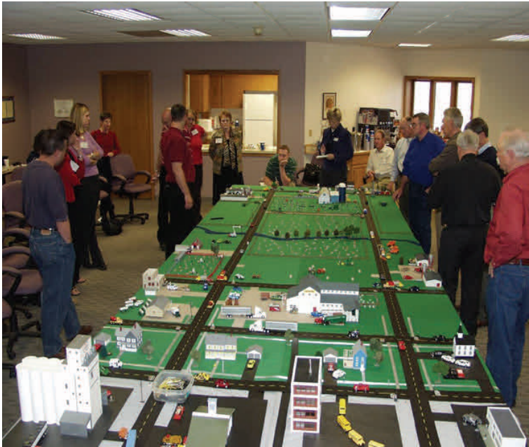
Table-top interactive scale model of a rural American community used for this training.

This educational program of the Montana Agro-Emergency Preparedness Committee and MSU Extension will be held on Wednesday, November 9, 2011 at Montana State University in Bozeman. The program is offered at no charge to participants. It was funded by a U.S. Department of Homeland Security grant, administered by Montana Disaster and Emergency Services.